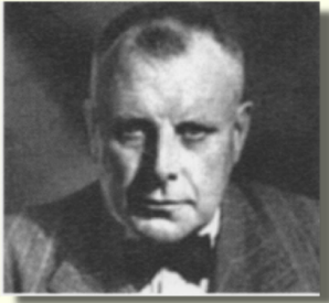
Henry Hamilton Bailey 1894-1961

I first came upon Bailey and Love's Short Practice of Surgery as a third year medical student some forty years ago. So began a long association, one I know many readers of the Newsletter will share.