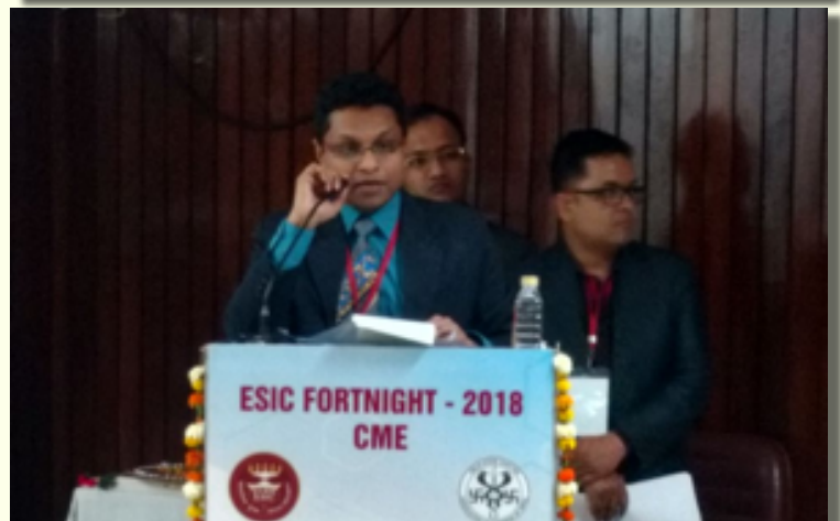
ESI HOSPITAL, BASIAIDARAPUR, under the aegis of Delhi State Chapter organized one day cme on COLORECTAL CANCER UPDATE on 6th march ,2018